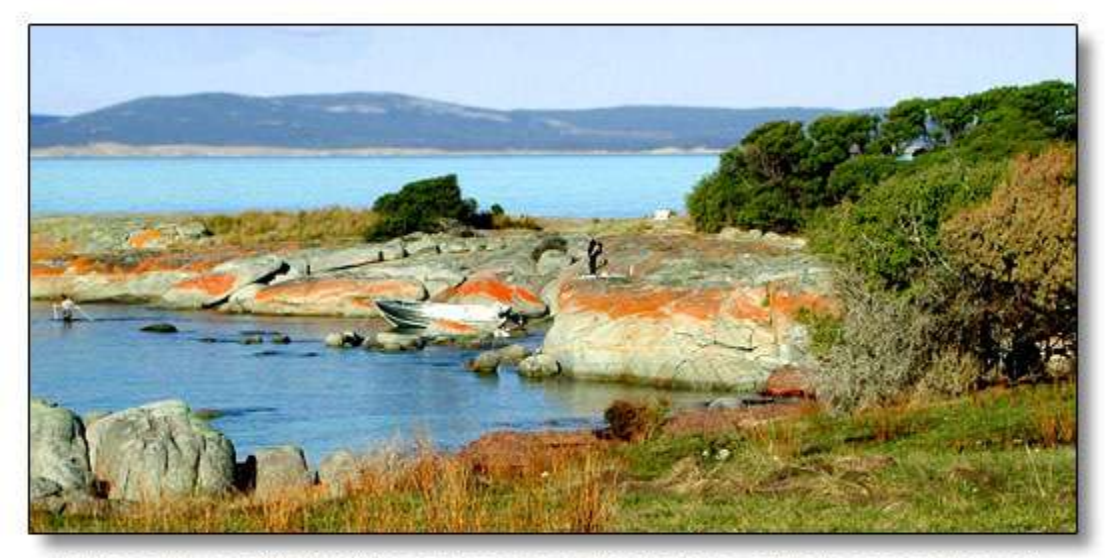
In the past it was difficult to bring equipment onto the islands to undertake conservation work.

Several jurisdictions in Australia are seeking amendments to their legislation to better accommodate Indigenous lands, uses and aspirations in day-to-day protected area management. In the Northern Territory and Western Australia, legislative amendments are proposed to recognise IPAs in law and allow government agencies to develop programs that will support the establishment and management of IPAs.