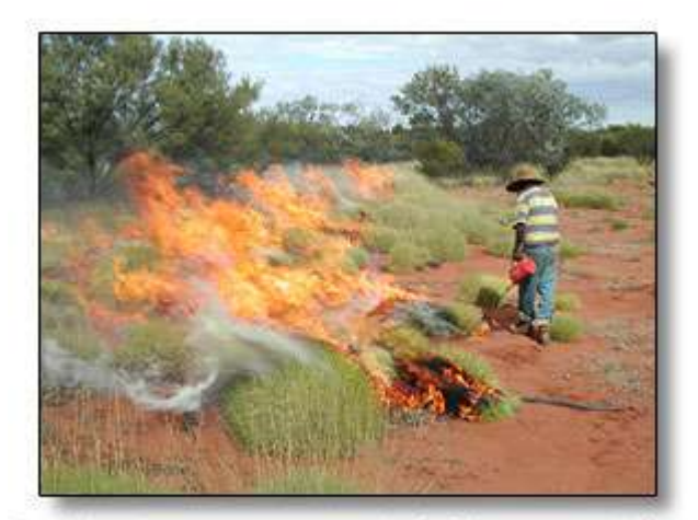
Figure 2: Continuation of traditional burning practices is essential for the maintenance of biodiversity and cultural values in Walalkara and Watarru Indigenous Protected Areas in South Australia.